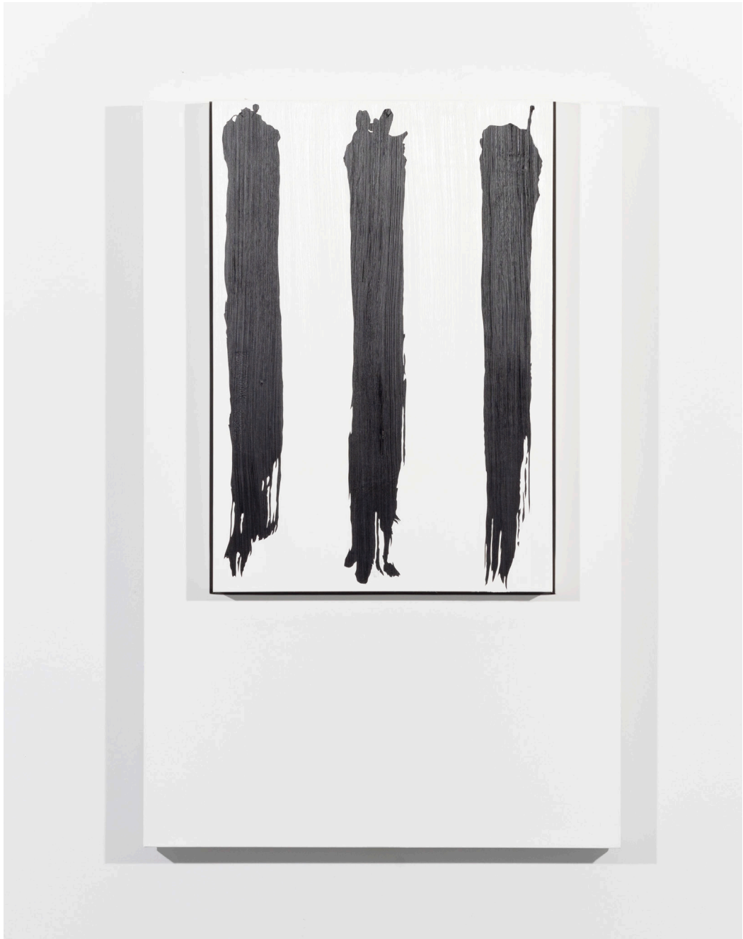
Untitled, 2019 Oil on canvas 98 x 65cm