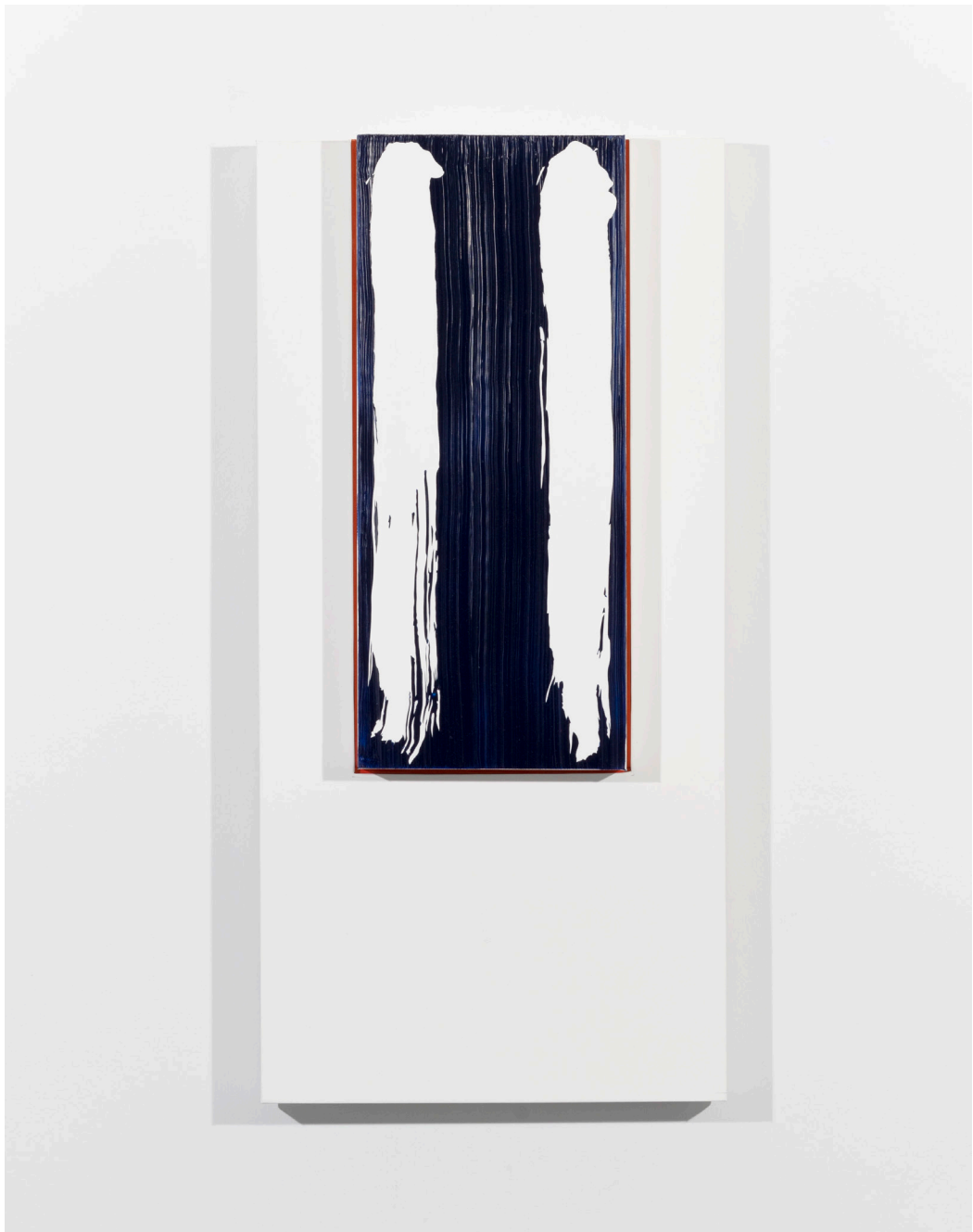
Untitled, 2019 Oil on canvas 98 x 48cm