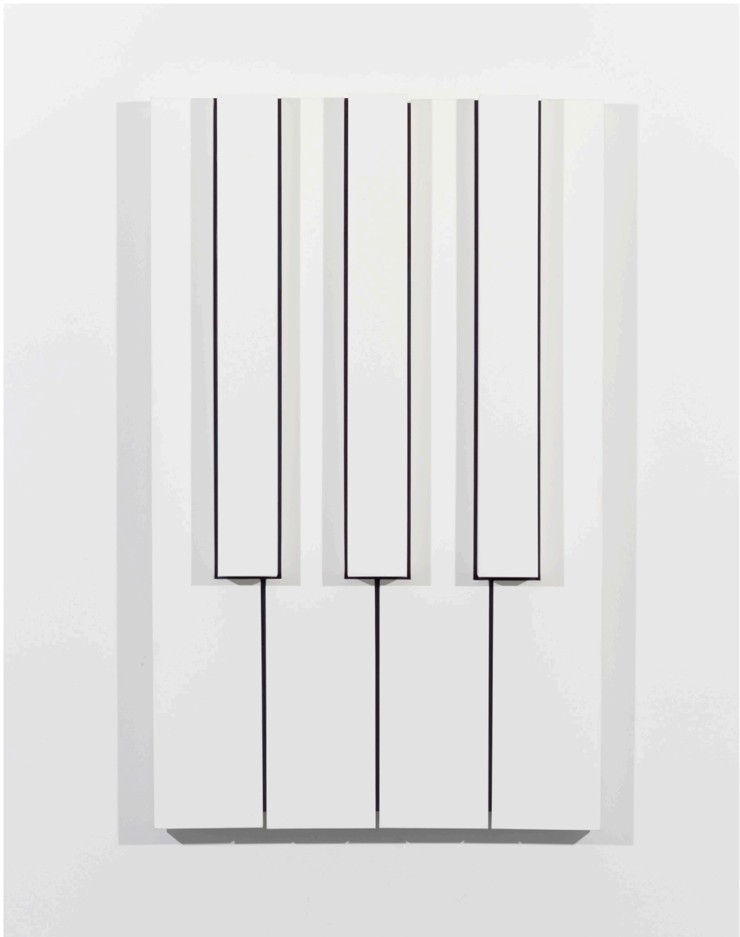
Untitled, 2019 canvas 98 x 65cm