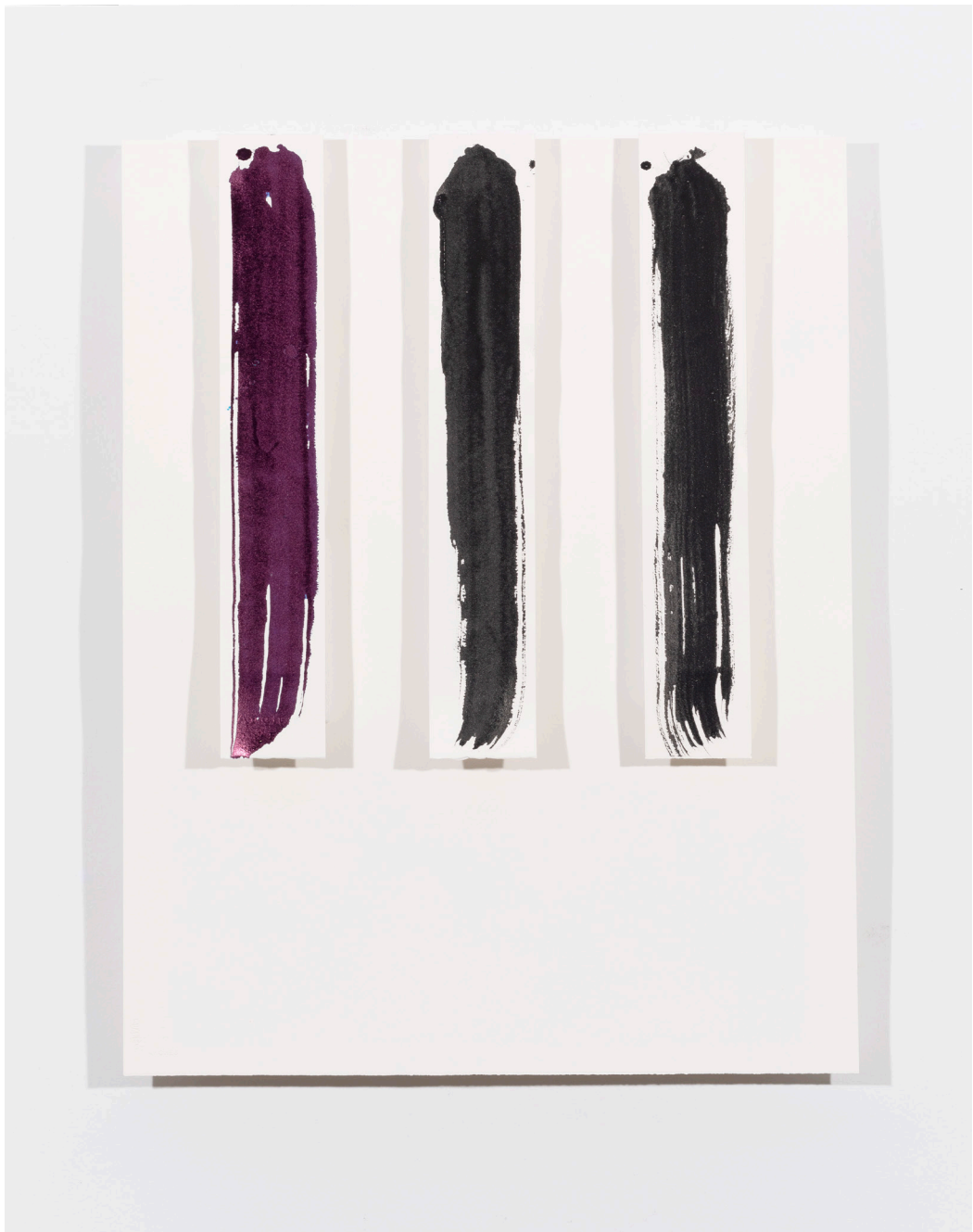
Untitled, 2019 Ink on paper 91 x 58cm