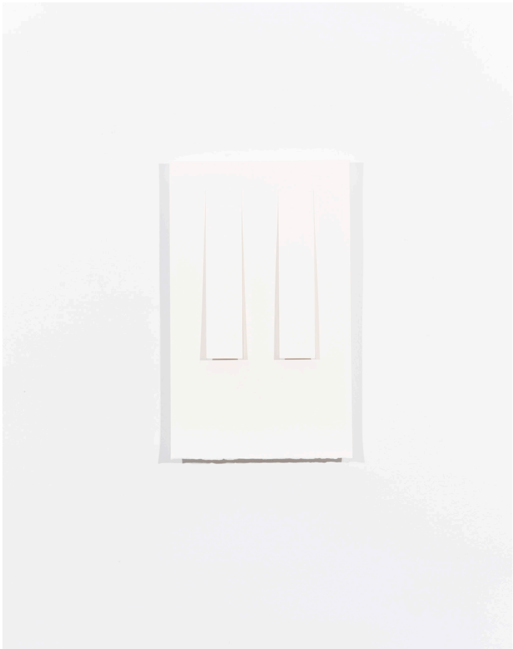
Untitled, 2019 Paper 54 x 27cm