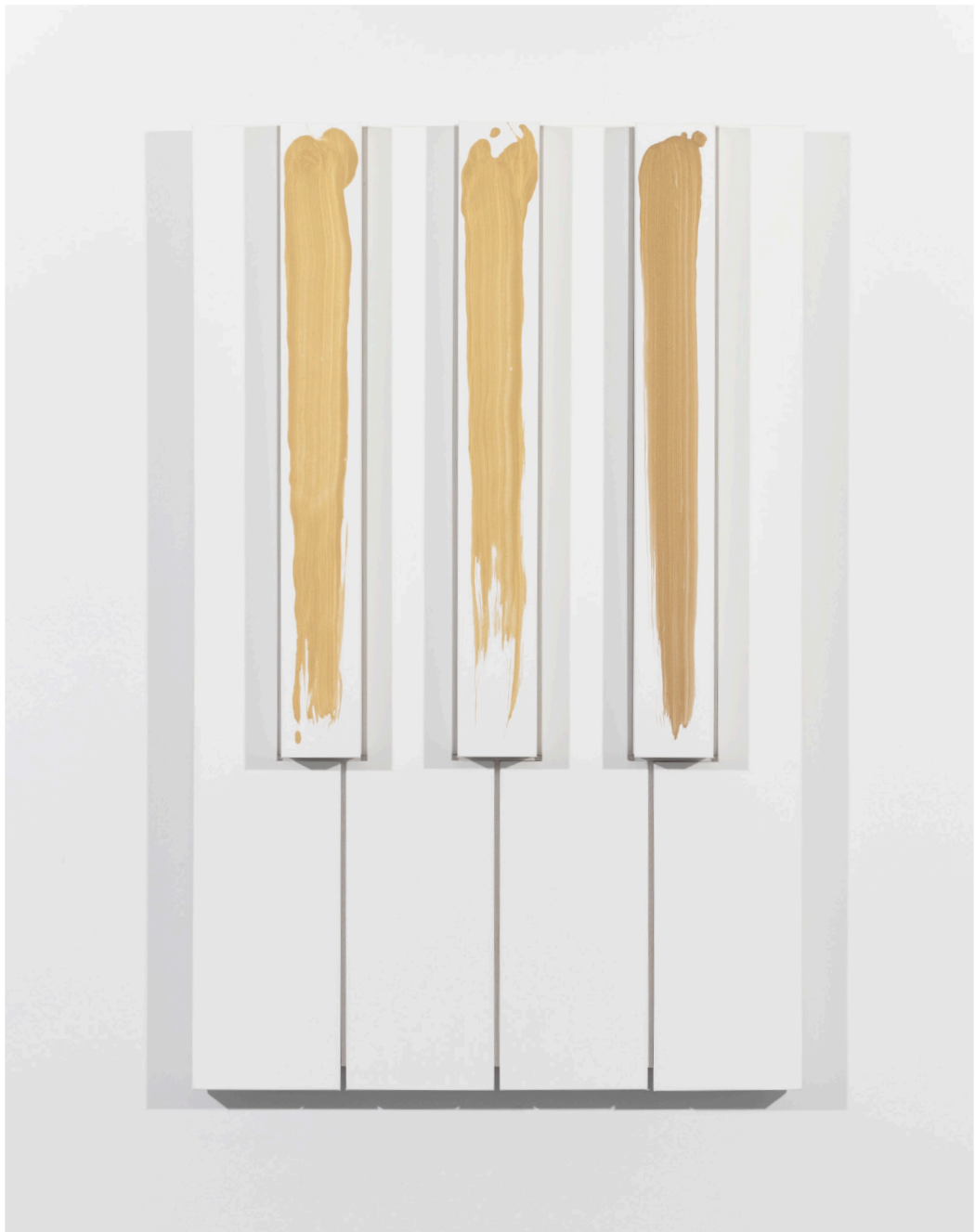
Untitled, 2019 Acrylic on canvas 98 x 65cm