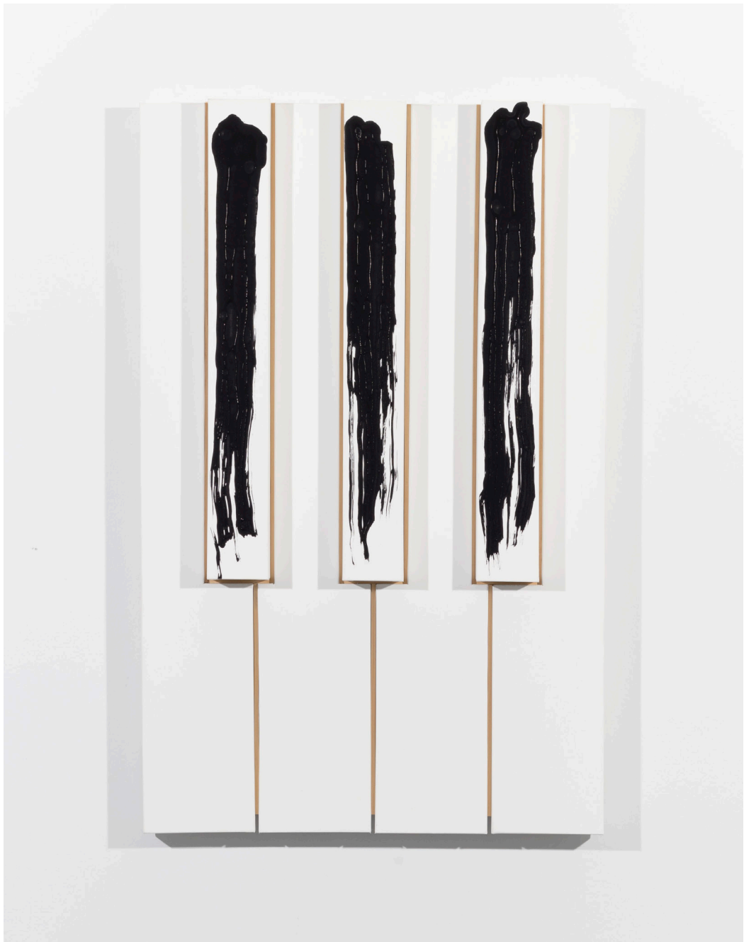
Untitled, 2019 Ink on canvas 98 x 65cm