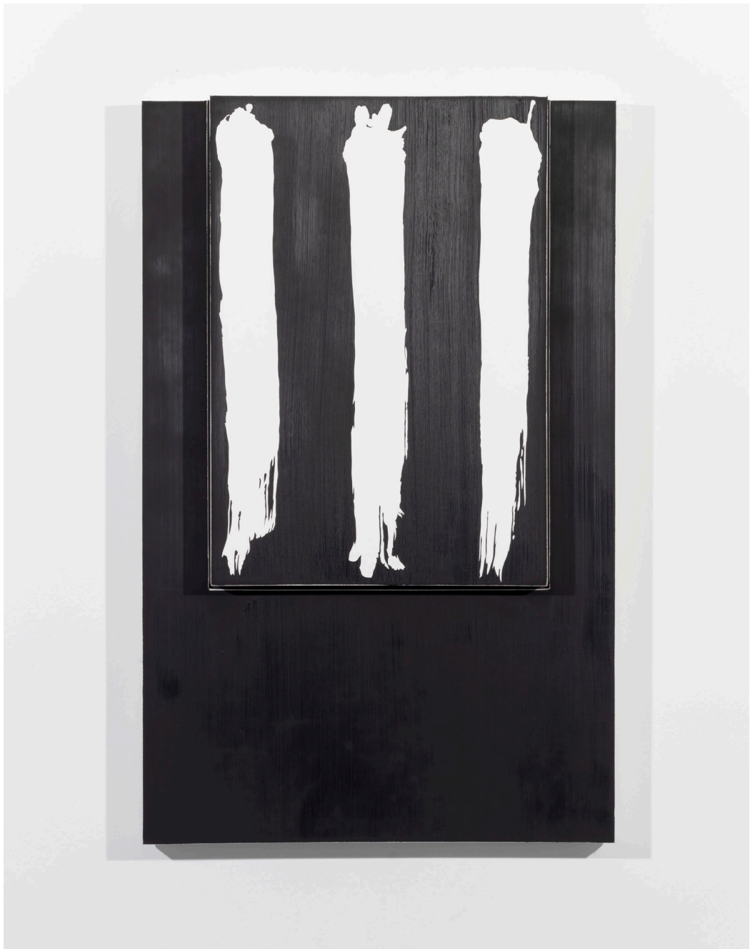
Untitled, 2019 Oil on canvas 98 x 65cm