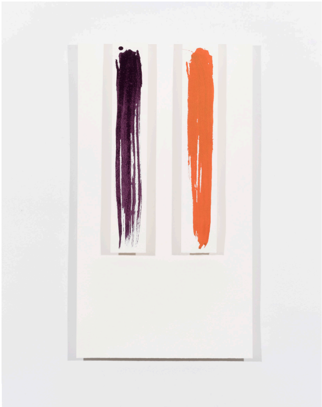
Untitled, 2019 Ink on paper 91 x 42cm