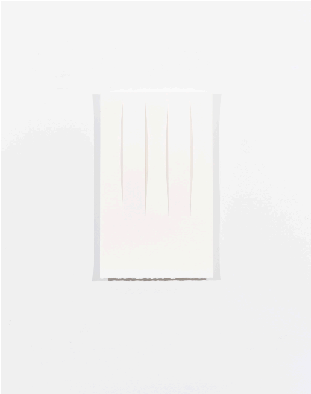
Untitled, 2019 Paper 54 x 27cm