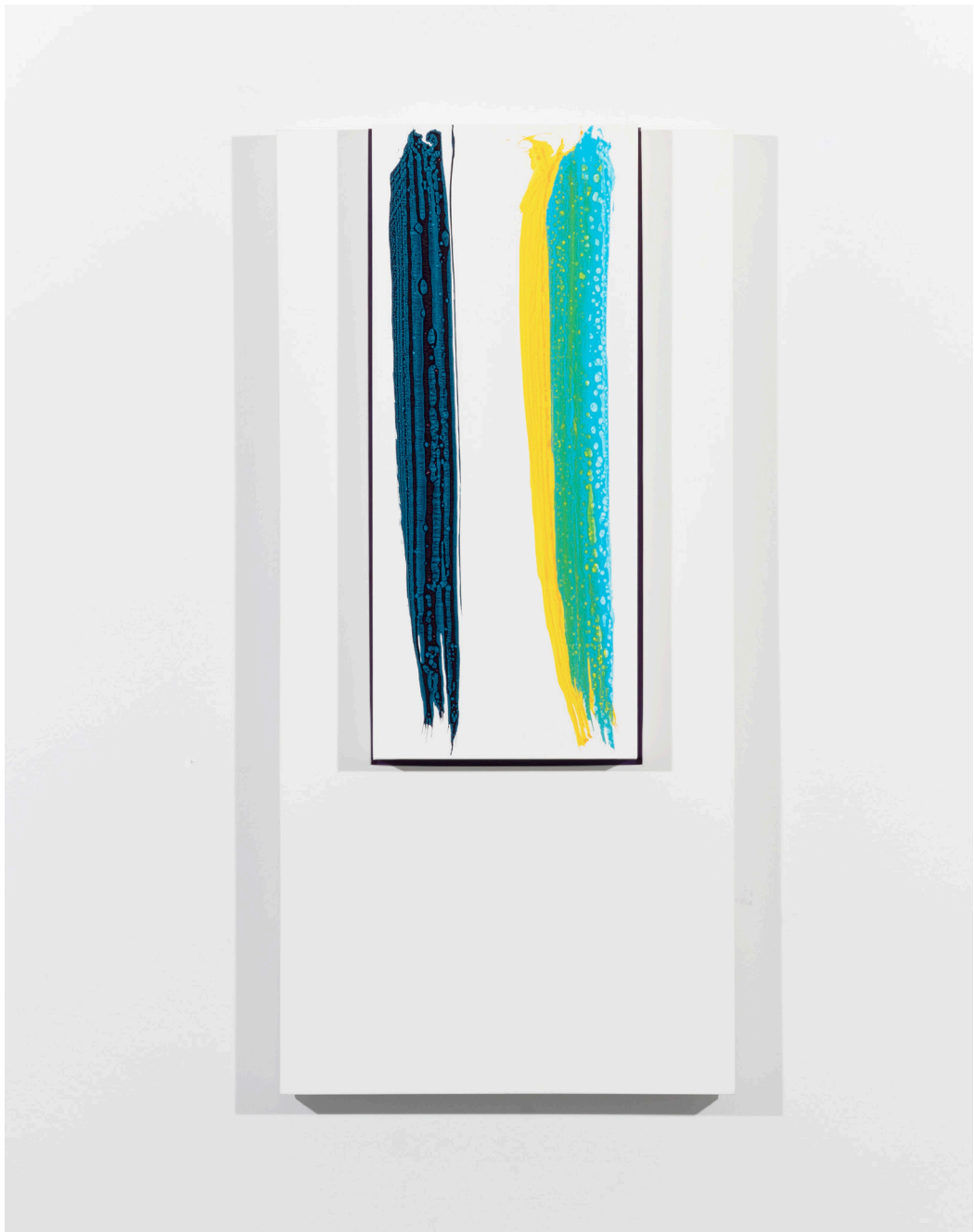
Untitled, 2019 Ink on canvas 98 x 48cm