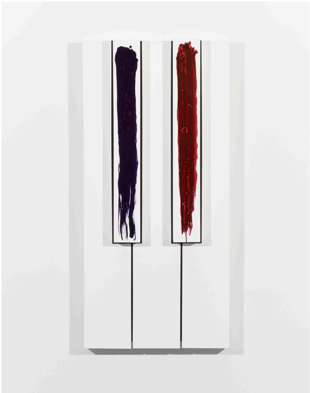
Untitled, 2019 Ink on canvas 98 x 48cm